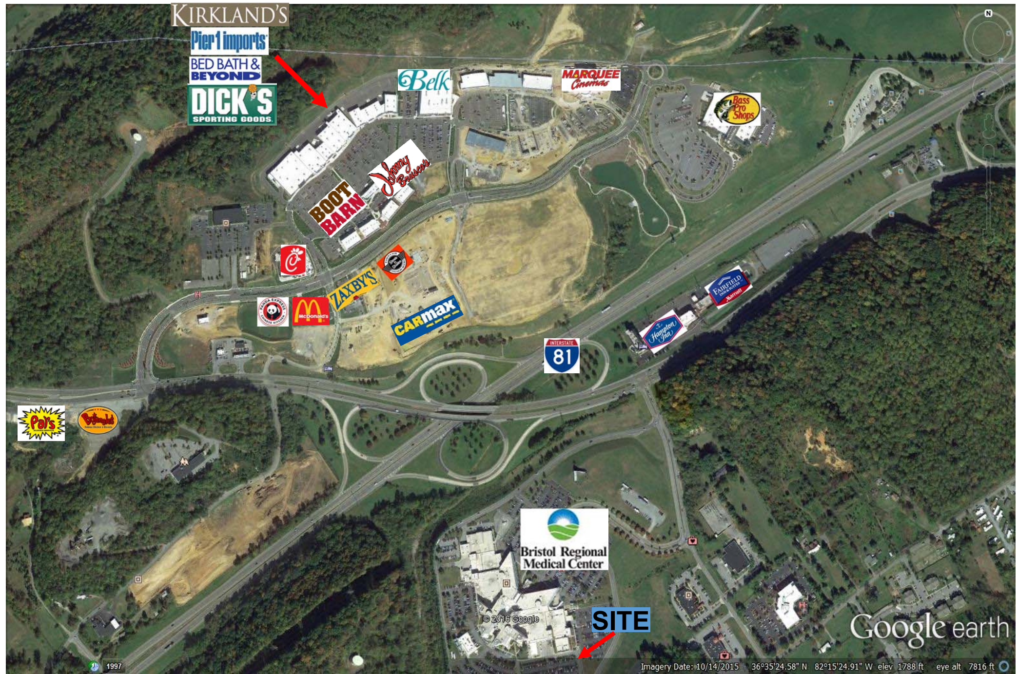
Pinnacle Shopping Center Bristol, Tennessee